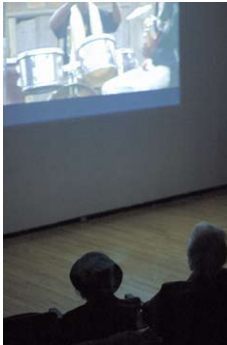
UNA-USA Queens members at the UN Day 2007 showing of the Sierra Leone's Refugee All Stars Film in the background.