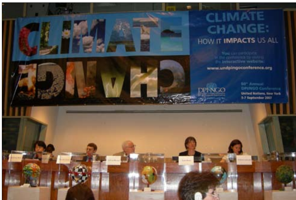
DPI/NGO 60th Annual Conference banner shows the importance of Climate Change and how it is affecting the work of the NGOs in tackling various issues brought about by the changing climate and how that affects people's lives and how aid is distributed and planned.

The nearly 2000 civil society representatives from 90 countries includ-