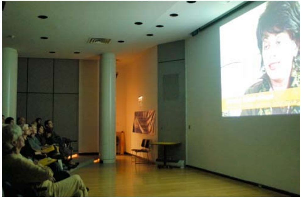
UNA-USA members and the public during the screening of Afghan Women: A History of Struggle

The treaty was adopted by the United Nations General Assembly in December 1979 and has been ratified