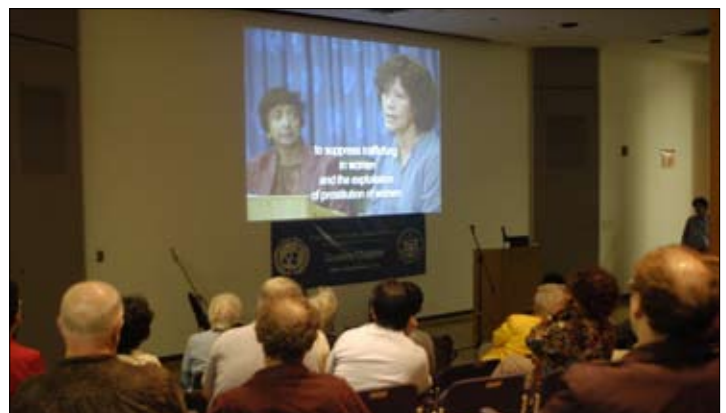
A video about CEDAW was shown along with the UNA-USA video in the QMA theater after the dinner.