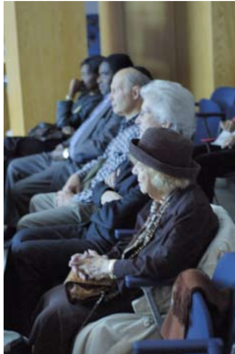
UNA-USA Queens members at the Sierra Leone Refugee All Stars screening.